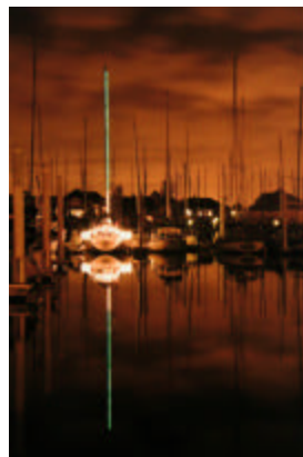
Christmas on the Coast