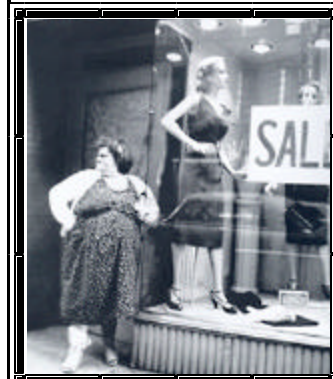
"Beyond Reach" 1960

has an exhibit of his widely acclaimed black and white photographs at the Fay Gold Gallery located at 764 Miami Circle. The images will be up through April 30th.